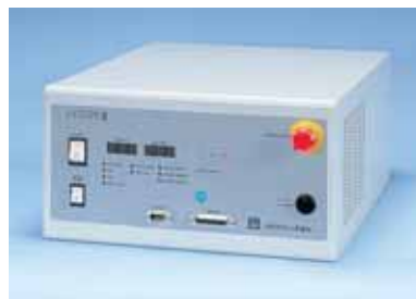
• Iron tip cleaner (UJC-212)