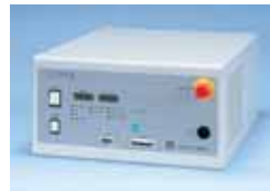
• Soldering controller (LN3-02)