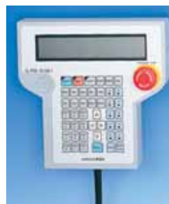
• Teaching box (LN3-03)